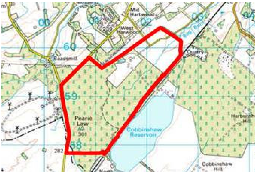
Figure 1 – Windfarm footprint

Nature of Works: Drainage Upgrade & Road widening on U40. The road is being used as the delivery route for wind turbines to the new Pearie Law wind farm which will be situated to the south west of the road (see red boundary in Figure 1). The road needs to be widened as the delivery vehicles are extremely large and wide. To allow this work to take place the road is scheduled to close on 17 September for up to 6 weeks. The road will be widened by laying crushed stone in the ditches and the ditches will be piped to maintain the existing drainage.