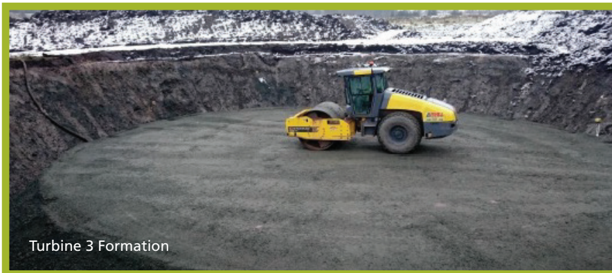
Turbine 3 Formation