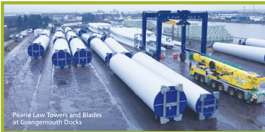
Pearie Law Towers and Blades at Grangemouth Docks

We would like to thank the feedback that we have received from residents since the last newsletter and believe that the issues have been addressed. As always we invite any further comments on the contact details noted below.